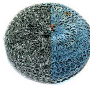
KleenKnit™ scourer before and after corrosion testing

A KleenKnit™ galvanised steel scouring pad, and a leading competitor's galvanised pad were placed in separate identical bowls of tap water for 7 days. The water was then allowed to evaporate at ambient conditions. The pictures below show the before and after states of the two scourers.